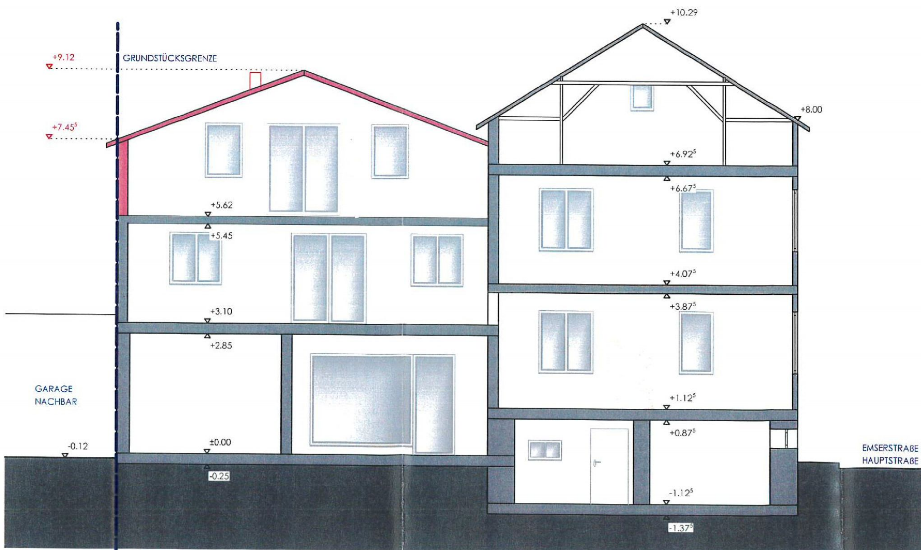
Schnitt BB NEU, M 1:100